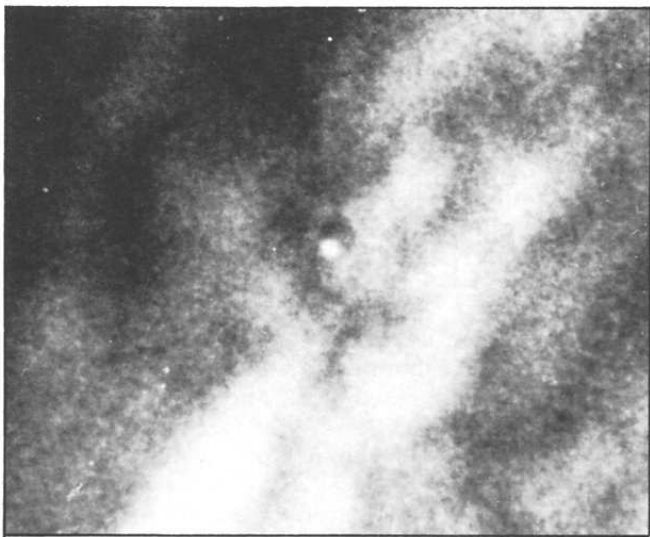
Fig. 1. Initial appearance.

Her parents were present on one occasion but the figure entered the room behind an open door and stood there, hidden from them.